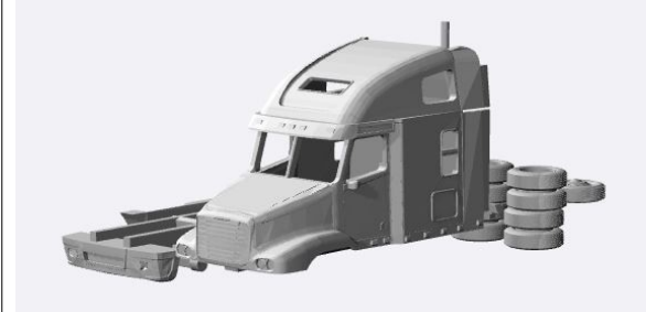
{\color{blue} \underline{https://www.shapeways.com/product/7TL467GFH/1-160-fright liner-century}}